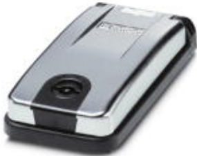
Mounting frame for one front plate/socket, frame: black, cover: metallic, closed with 3 mm two-way key bit.

Please be informed that the data shown in this PDF Document is generated from our Online Catalog. Please find the complete data in the user's documentation. Our General Terms of Use for Downloads are valid ( http://phoenixcontact.com/download )