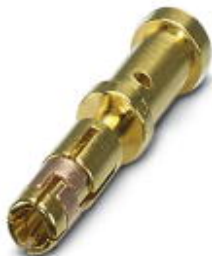
Crimp contact, turned, contact diameter: 1 mm, crimp range: 0.34 mm 2 ... 0.5 mm 2

Please be informed that the data shown in this PDF Document is generated from our Online Catalog. Please find the complete data in the user's documentation. Our General Terms of Use for Downloads are valid ( http://phoenixcontact.com/download )