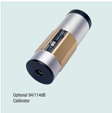
Optional 94/114dB Calibrator