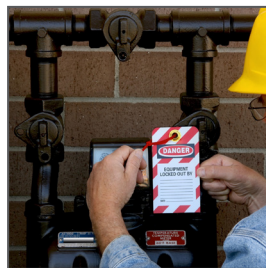
Lockout Tagout Apparatus