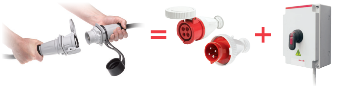
Woodhead ArcArrest 30.0A Switch-Rated Connector

Unlike standard connectors, switch-rated devices listed under UL 2682 can operate as switches and be used to disconnect loads while energized. When operated under load, arcing will occur between the male and female contacts, which they can withstand without damage. The user is completely shielded from this energy because the plug maintains a connection with the receptacle during operation. A twisting motion must be applied by the user to remove the plug after the circuit has been interrupted. The UL test requires this live switching to occur 6,000 cycles. This proves the connector's ability to last for many years in a typical industrial application.