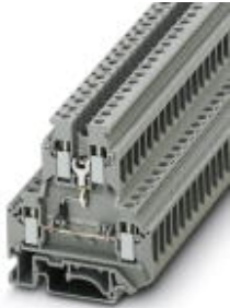
Double-level terminal block, with preassembled resistors

Please be informed that the data shown in this PDF Document is generated from our Online Catalog. Please find the complete data in the user's documentation. Our General Terms of Use for Downloads are valid ( http://download.phoenixcontact.com )