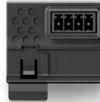
RS485 interface - Black